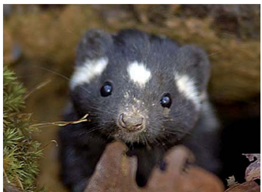
Spotted Skunk/Mundy Hackett