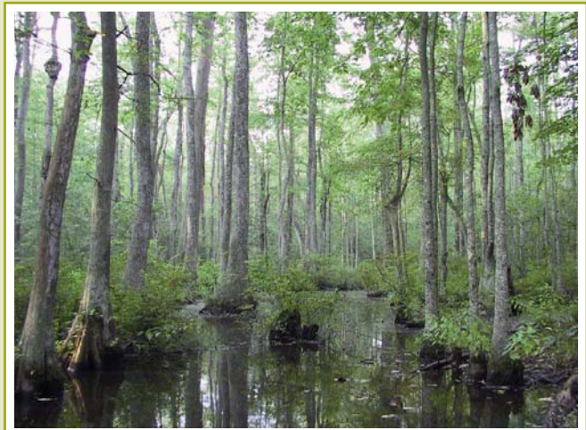
Lorance Creek Natural Area. Lower Mississippi River Bottomland habitat/AGFC

Habitat alteration, such as road construction, can also introduce sediments into flowing waters to the detriment of fish, mussels, dragonflies and other aquatic species that require clear, clean water.