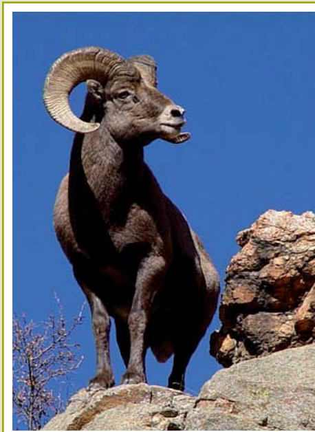
Big Horn Sheep

To create an action plan, the Colorado Division of Wildlife developed an eight-