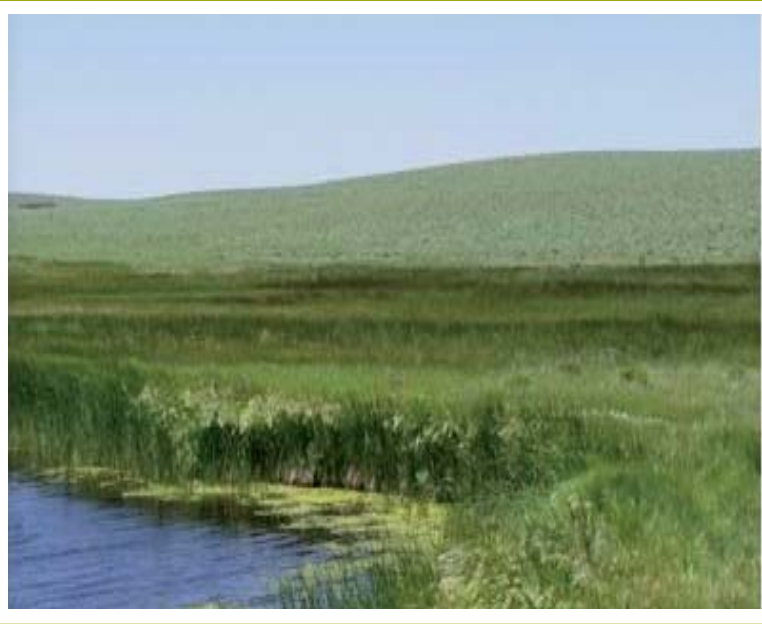
CO Division of Wildlife

developing status, condition, trends, and threats for identified species and habitats. A draft plan addressing the eight required elements was distributed via Internet and also reviewed in four public meetings across the State to prepare the final draft.