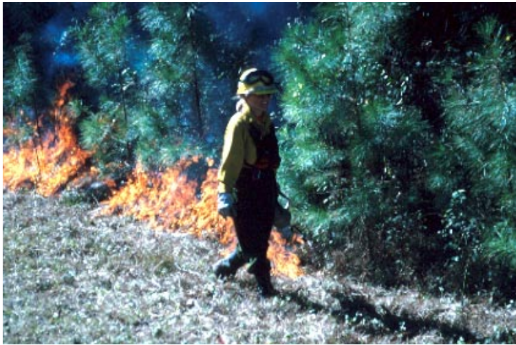
USGS researcher assisting in a prescribed burn at the Kisatchie National Forest. Prescribed fire is now a primary tool in land management and restoration efforts.

The new Federal Wildland Fire Policy recognizes that past practices of aggressive fire suppression have led to conditions of historically unprecedented fuel loads, or