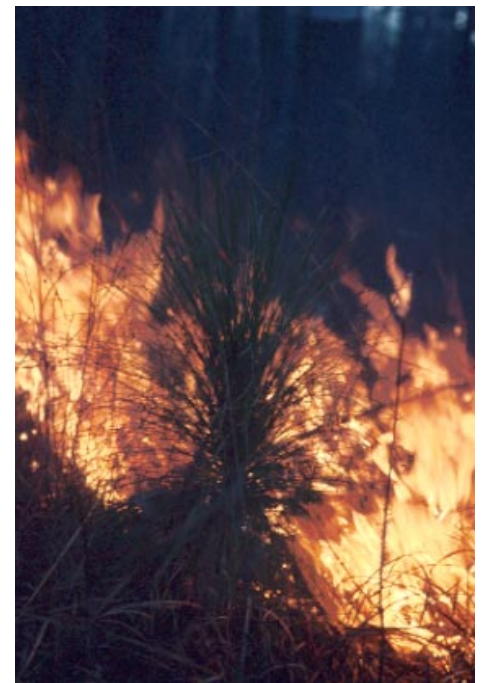
Historically, fire's destructive force has been viewed as an enemy of both humans and native species.

Historically, human influences have dramatically altered fire effects on the North American landscape. Native Americans used fire to change vegetation patterns prior to European colonization. Following European settlement, fire became viewed as a natural force that should be controlled. Throughout much of