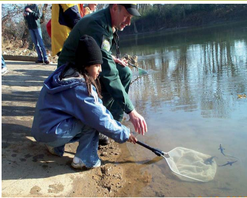
Stocking Lake Sturgeon/Georgia DNR

- Noel Holcomb, Commissioner, Georgia Department of Natural Resources