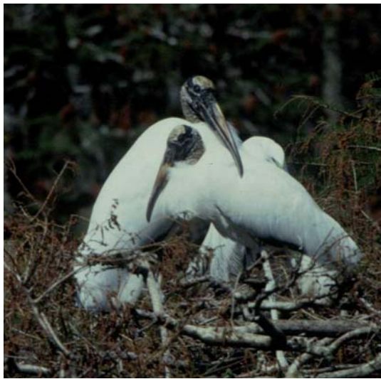
Wood Storks

The general approach taken in the planning effort was to emphasize activities that would lead to more effective wildlife