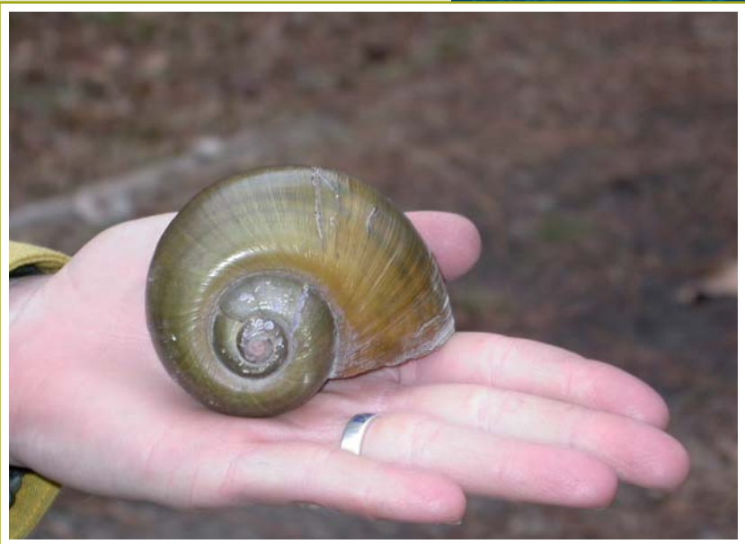
Invasive Channelled apple snail

The construction of dams and impoundments (from agricultural ponds to large reservoirs) can alter stream flows and water temperatures and create barriers to dispersal of fish and other aquatic species. Many of Georgia's imperiled aquatic species are vulnerable to habitat degradation and fragmentation resulting from man-made impoundments.