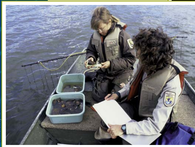
Ohio River study