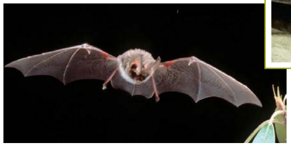
Rafinesque's Big-Eared Bat