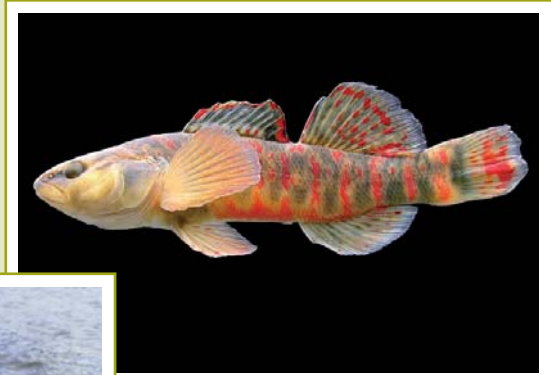
Cumberland arrow darter

This detailed, pre-existing data was used in developing the Action Plan. Several news releases, an article in Kentucky Afield Magazine, and links on the Department's web page were used to inform the public of the state's efforts. Additionally, input was solicited from 44 experts representing five federal agencies, three state agencies, eleven universities, and seven private organizations to provide detailed information needed to develop the Action Plan.