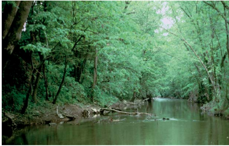
Stream habitat