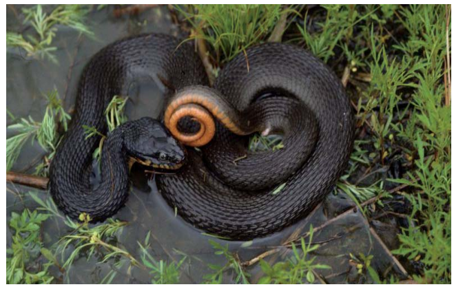
Copperbelly water snake

tailed accounts were developed for each species that included distribution maps, habitat requirements, and condition of their populations. In order to give consideration to both individual species and habitat types, species were assigned to groups (guilds) based on the similarities of habitat used, then conservation strategies and actions were then assigned to the habitat groups.