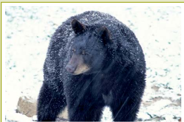
Black Bear in the snow

Kentucky's Wildlife Action Plan provides background information and the framework needed to protect the state's wildlife species and their habitats. Kentucky used a species-based approach to developing the Action Plan. A list of 251 species were identified as having a great need for conservation work. De-