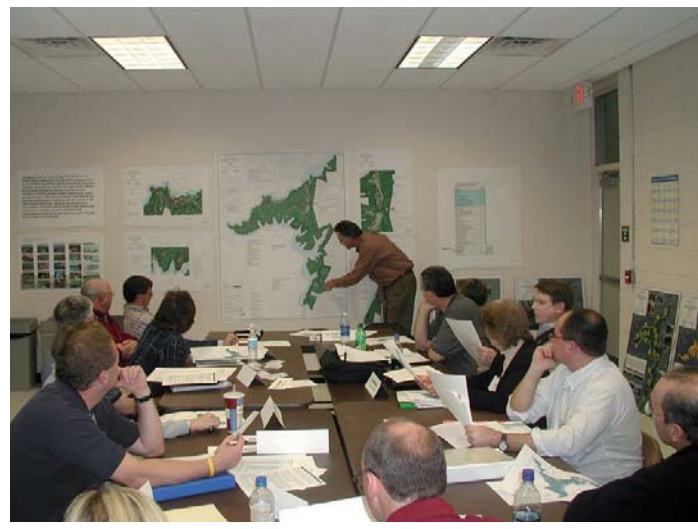
Wildlife stakeholders meeting in Wake County/NCWRC

Habitat Fragmentation: Road construction, urban corridors, and dams are examples of manmade barriers that break larger habitat units into smaller units, hinder wildlife movement, and isolate wildlife into smaller and more vulnerable populations. Dams deny access to spawning grounds to fish that live in the sea and reproduce in freshwater, while associated reservoirs may isolate freshwater mussel populations trapped in the small headwaters of drowned tributaries to the impounded waters. Available