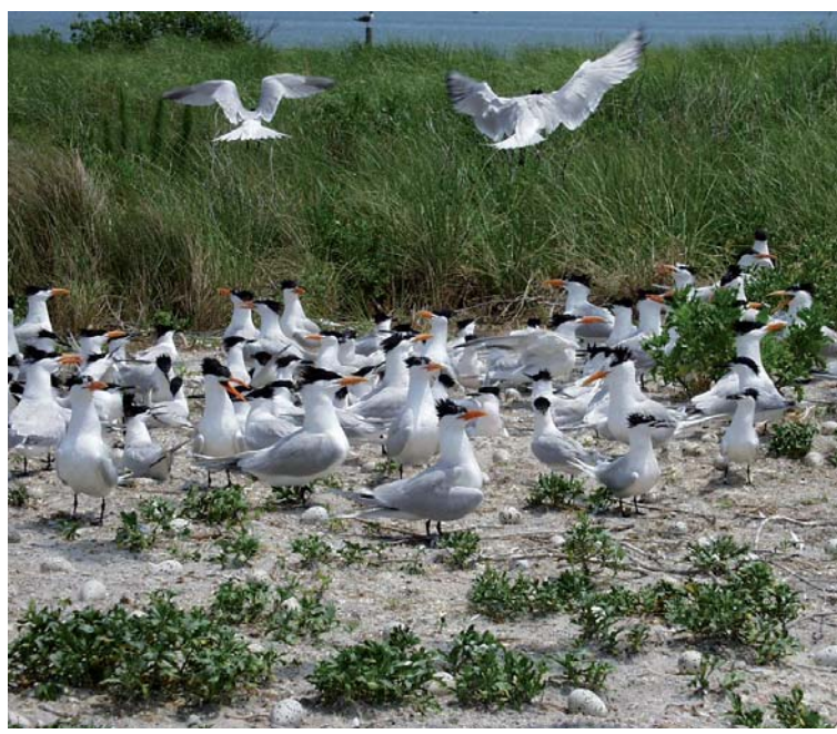
Royal tern colony/NCWRC

The North Carolina Wildlife Action Plan charts the course, and North Carolinians now have the opportunity to help conserve the wildlife resources of the State of North Carolina for the use and enjoyment of present and future generations.