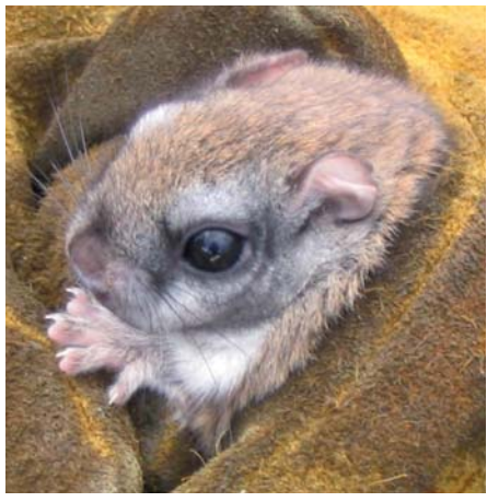
Northern Flying Squirrel/NCWRC

conserving North Carolina’s wildlife and habitats. It builds on the strategic thinking of many organizations in North Carolina’s conservation community and reflects the ideas and input of many of the state’s citizens. It takes a habitat-based approach to addressing the needs of the state’s conservation priority wildlife. The plan gives 371 species statewide priority status for conservation efforts. It categorizes