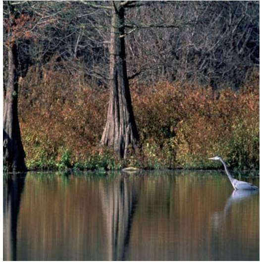
Wading Bird

A total of 37 potential sources of stress were identified as affecting Greatest Conservation Need (GCN) species and habitats. Incompatible land use and development were consistently identified as major sources of stress to GCN species. Additionally, the lack of distributional data for many of the GCN species is a substantial impediment to fully utilizing the tools developed within this Wildlife Action Plan.