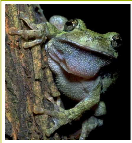
Tree Frog/Robert English

Appalachian mountains considered the world's epicenter of lungless salamander diversity. Furthermore, 55 reptiles (snakes lizards and turtles) and 77 mammals, including 12 species of bats, inhabit Tennessee. The diversity of aquatic habitats supports an unparalleled array of aquatic species. Seventy-six species of crayfish, 99 species of aquatic snails, 130 species of freshwater mussels and over 325 species of fish all call Tennessee home.