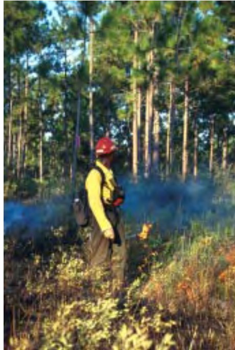
At the Mississippi Sandhill Crane National Wildlife Refuge, fire is mainly applied in the fall and in the spring. Fall fire reduces overstocked planted slash pine and enhances crane nesting areas, while spring fire clears unwanted woody vegetation from overgrown areas on the savannas.

Historically, fire was a naturally occurring phenomenon in the wet pine savannas, shaping the appearance of the landscape by burning off grasses, shrubs, and pine litter frequently. Fire suppression has interfered with this natural process, allowing woody plants such as trees and shrubs to invade and shade out native sun-loving herbs in these plant communities. Wet pine savannas have been shown to contain the highest diversity of plant species per square meter than any other plant community throughout the southeastern United States. Frequently burned wet pine savannas are dominated by a variety of grasses, herbs, and sedges. In addition, wet pine savannas are host to more