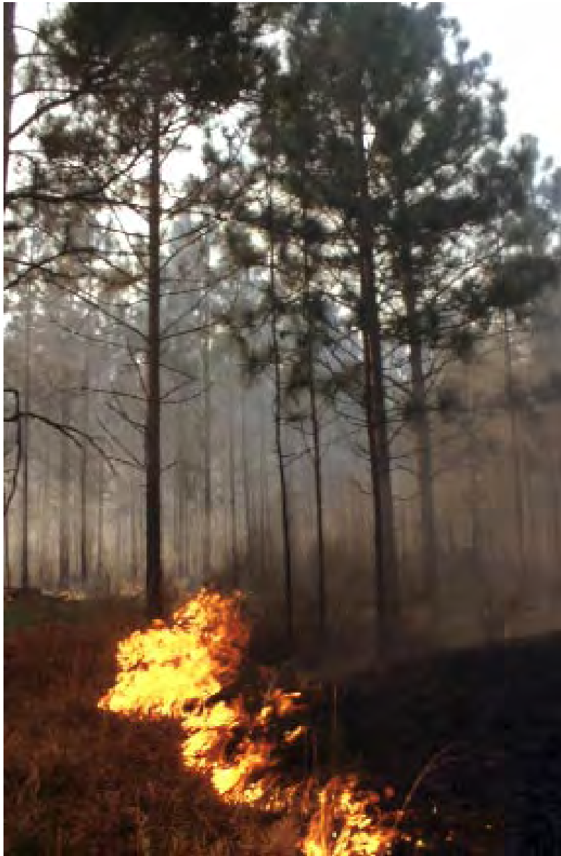
Fire, whether naturally occurring or prescribed, has a vital function in the ecosystem. Fires, such as the one shown here at Kisatchie National Forest, eliminate dead or dying plant matter, stimulate growth of native plants, and suppress the invasion of exotic species and the succession to woody species in many natural plant communities.

U.S. Geological Survey/National Wetlands Research Center, 700 Cajundome Blvd., Lafayette, LA 70506; 337-266-8500; Fax: 337-266-8513; http://www.nwrc.usgs.gov