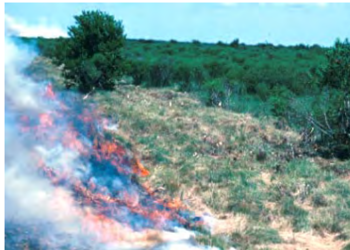
Prescribed fire on coastal prairie at the Brazoria National Wildlife Refuge. Before the coastal prairie became settled, fire was a sustaining force in the ecosystem. Low-intensity natural fire kept woody growth in check, yet the roots and bulbs of the native grasses remained undamaged. Fire suppression practices allow the accumulation of plant litter and other flammable materials and therefore increase the likelihood of a destructive, high-intensity wildfire.

NWRC scientists have been experimenting since 1996 with controlled burns in both the dormant season and the growth season to study the effects of timing of burns on Chinese tallow stands. Evidence so far indicates that burns conducted during the growth season are more effective in the long term than traditional dormant-season