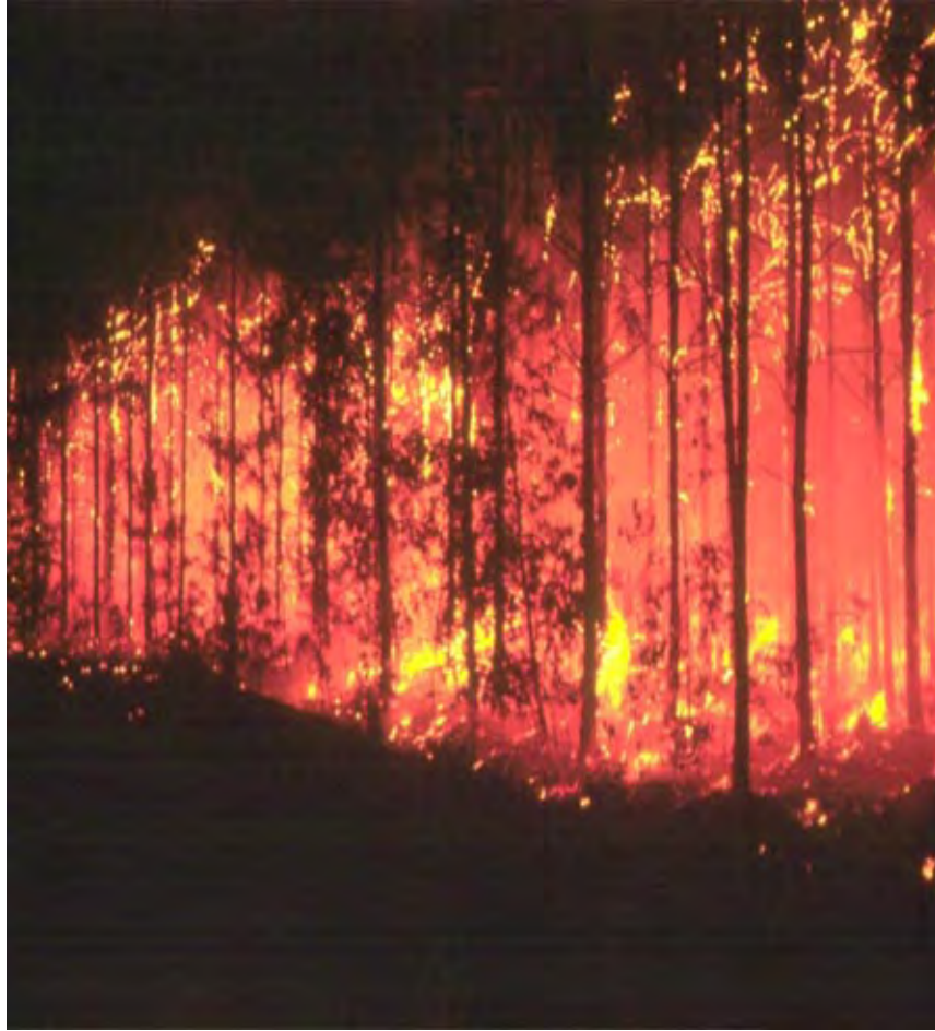
Although catastrophic fires like the ones in Florida in 1998 may have devastating impacts on timber resources, they may also prove to have ecological benefits. This photo shows catastrophic fire where torching and crowning are common.

At another study site, a freshwater coastal marsh in Louisiana, short-term burn history maps were generated using Thematic Mapper imagery. These maps cover winter preburn, spring recovery, and summer regrowth of