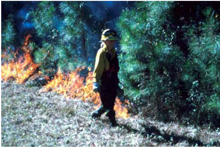
USGS researcher assisting in a prescribed burn at the Kisatchie National Forest. Prescribed fire is now a primary tool in land management and restoration efforts.

The new Federal Wildland Fire Policy recognizes that past practices of aggressive fire suppression have led to conditions of historically unprecedented fuel loads, or