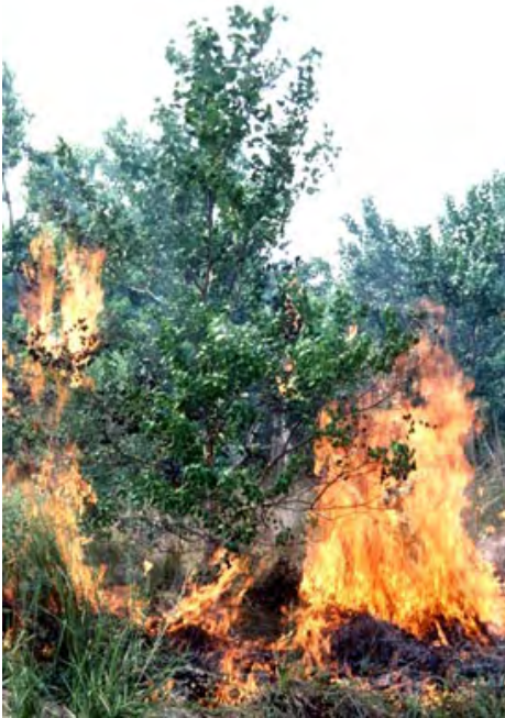
Chinese tallow being burned by winter fire.

burns, and that prescribed fire may indeed be a key in holding Chinese tallow at bay.