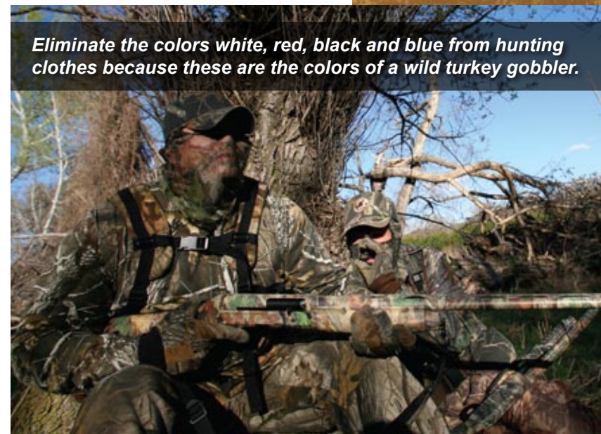
Eliminate the colors white, red, black and blue from hunting clothes because these are the colors of a wild turkey gobbler.