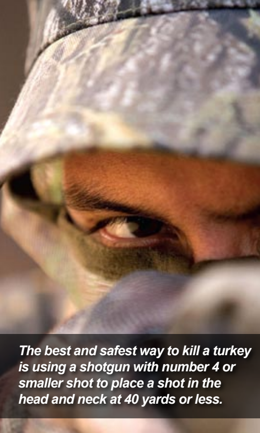
The best and safest way to kill a turkey is using a shotgun with number 4 or smaller shot to place a shot in the head and neck at 40 yards or less.