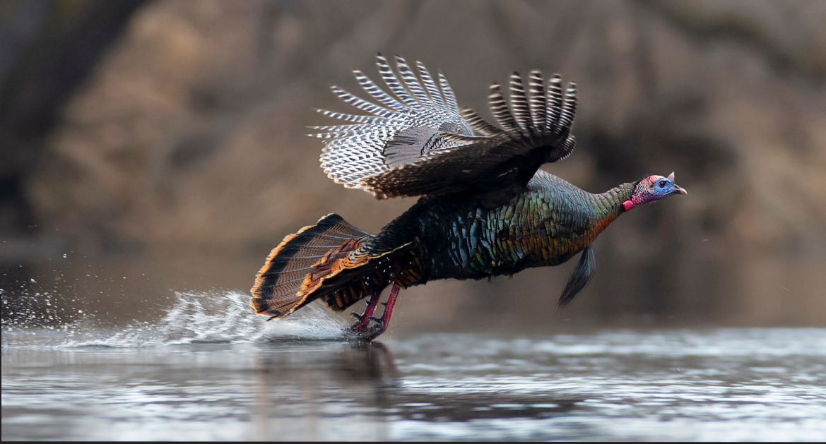
"Tom Flying Across River by Tom Martineau, 2025 Photo Contest Grand Prize Winner